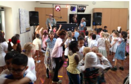
Have a lovely weekend,