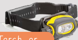
Torch or headlamp