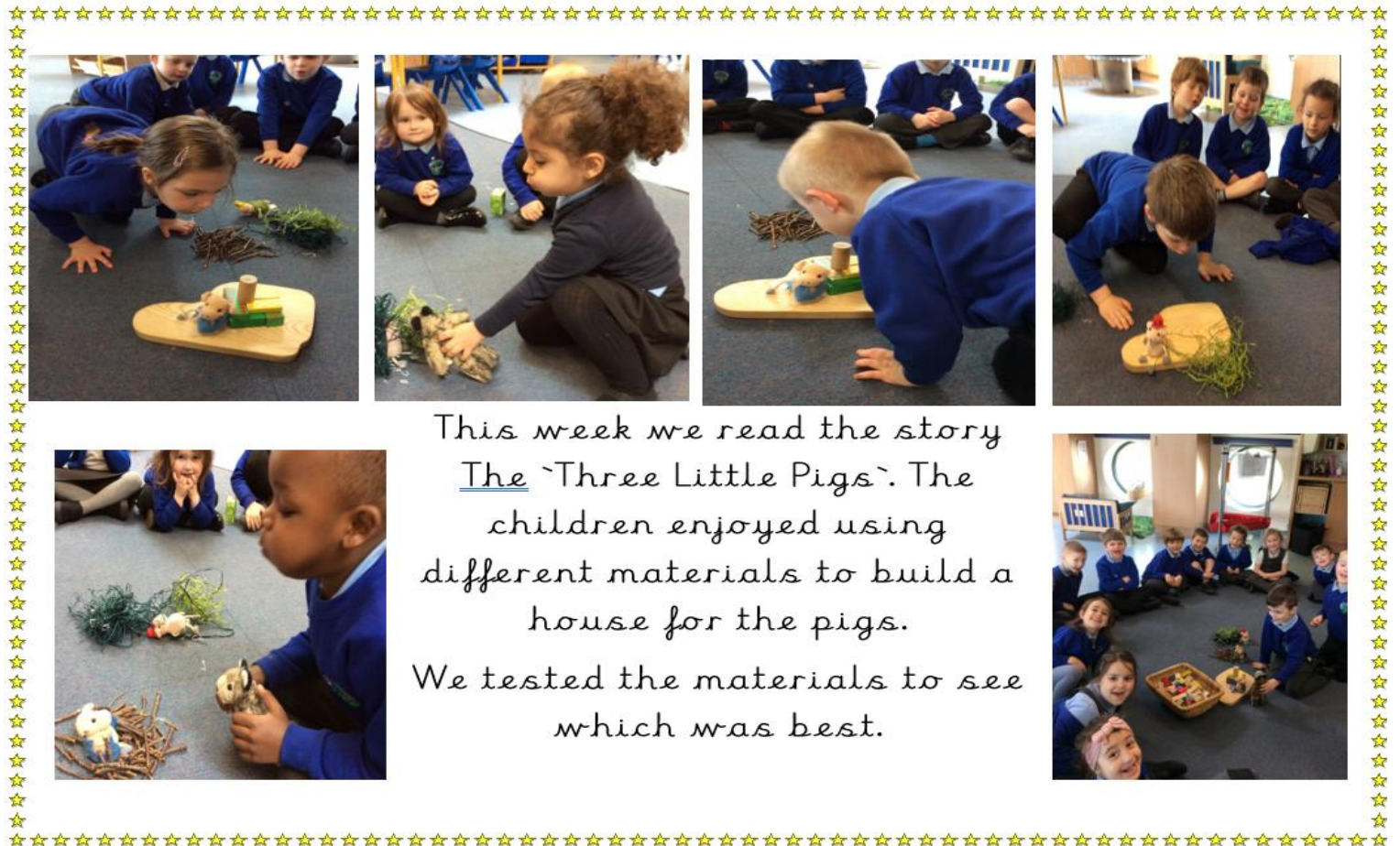
This week we read the story The 'Three Little Pigs' . The children enjoyed using different materials to build a house for the pigs. We tested the materials to see which was best.

If you have any queries please contact the school office on 01270 696810