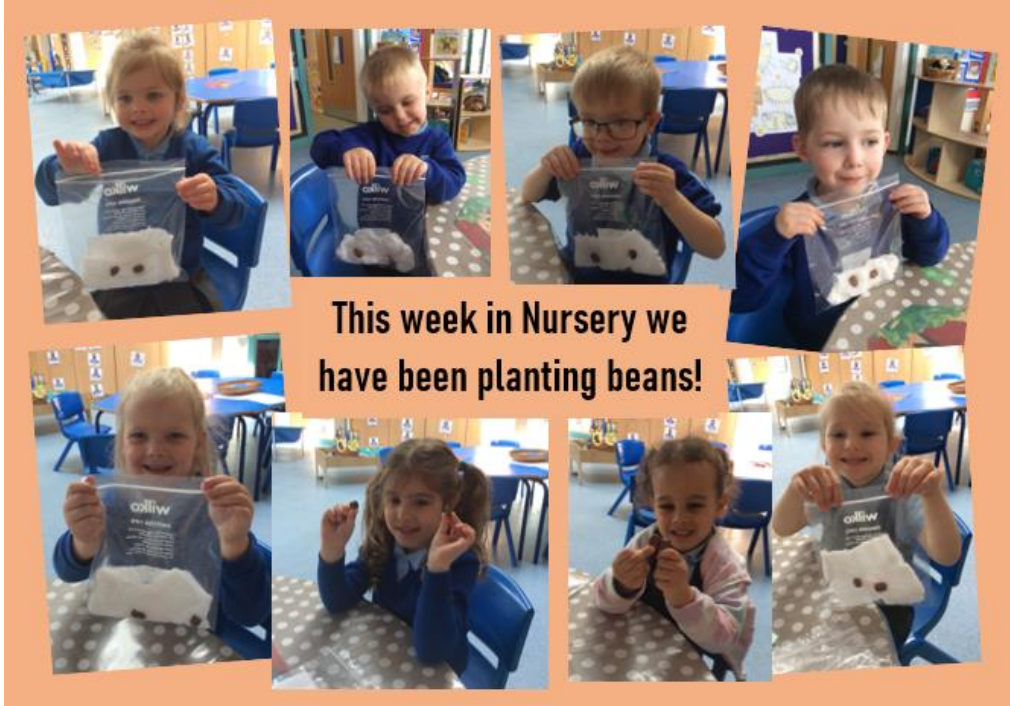
This week in Nursery we have been planting beans!