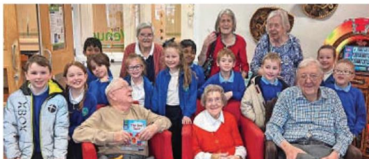
Year two pupils, aged six and seven-years-old, from Gainsborough Primary and Nursery School visited the Brookhouse Drive care village to read their favourite books

A chance for you to play with your child and look at their Learning Journey Book. Experience the Nursery and chat with teachers and other parents.